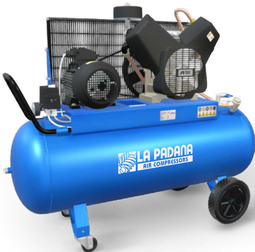
Composit resin piston